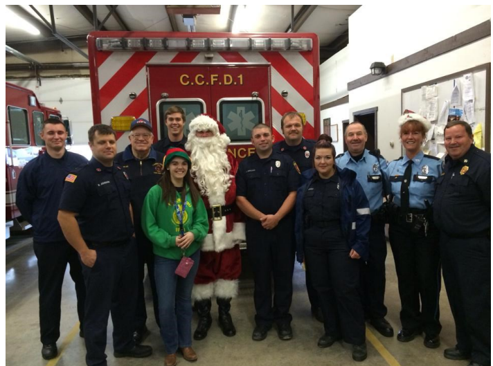
ABOVE: Firefighters from Campbell County Fire District One helping Santa in their community.