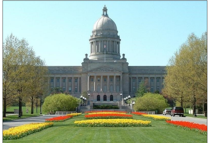
Kentucky State Capitol